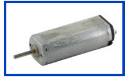
Weight: 3.9 g